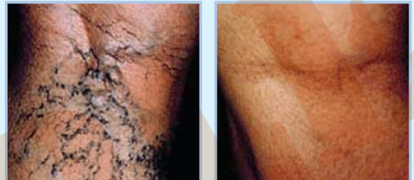
Varicose veins before and after sclerotherapy. Individual results can vary.

Sclerotherapy can be used to treat both varicose and spider veins. A tiny needle is used to inject the veins with one of several different kinds of chemical irritant, or sclerosant, that irritates the lining of the vein. In response, the veins collapse, seal shut, and are reabsorbed by the body.