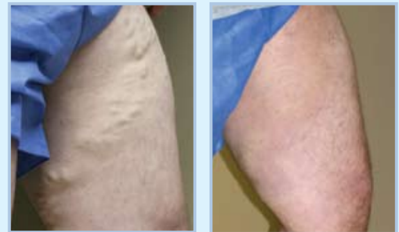
Varicose veins before and after thermal ablation. Individual results can vary.

Endovenous Thermal Ablation is a treatment alternative to surgical stripping of varicose veins. With ultrasound visualization, a small catheter or tube is inserted into the damaged vein, usually through a needle. Thermal energy, or heat, is then delivered inside the vein, which causes the vein to collapse and seal shut. The procedure is typically done in the doctor's office under local anesthesia. Afterwards, a leg wrap or prescription compression stocking is usually placed on the treated leg for 1-2 weeks. Patients are able to walk immediately after the procedure and most individuals are able to return to work the next day.