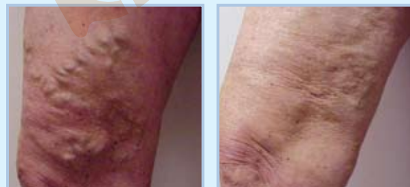
Varicose veins before and after ambulatory phlebectomy. Individual results can vary.

Ambulatory phlebectomy is a method of surgical removal of varicose veins at the surface of the skin. Small incisions are made next to the vein and sections of vein are removed through these small nicks. This is frequently done in the doctor's office using only local anesthesia. Afterwards, a leg wrap and/or compression stocking is